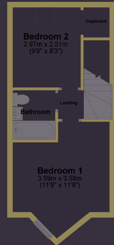
Plot 1 - 6