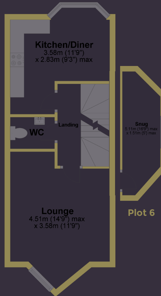
Plot 1 - 6